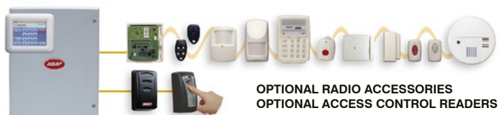
OPTIONAL RADIO ACCESSORIES OPTIONAL ACCESS CONTROL READERS